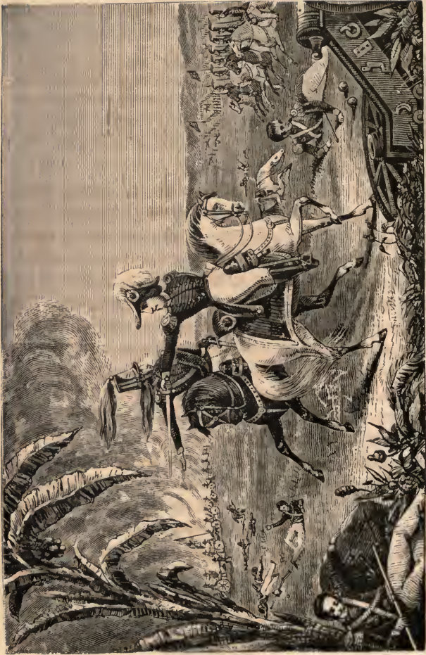
GENERAL TAYLOR AT THE BATTLE OF RESACA DE LA PALMA.